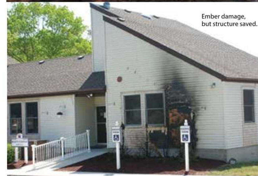
Ember damage, but structure saved.