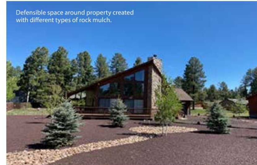
Defensible space around property created with different types of rock mulch.

Ready begins with property owners taking action.