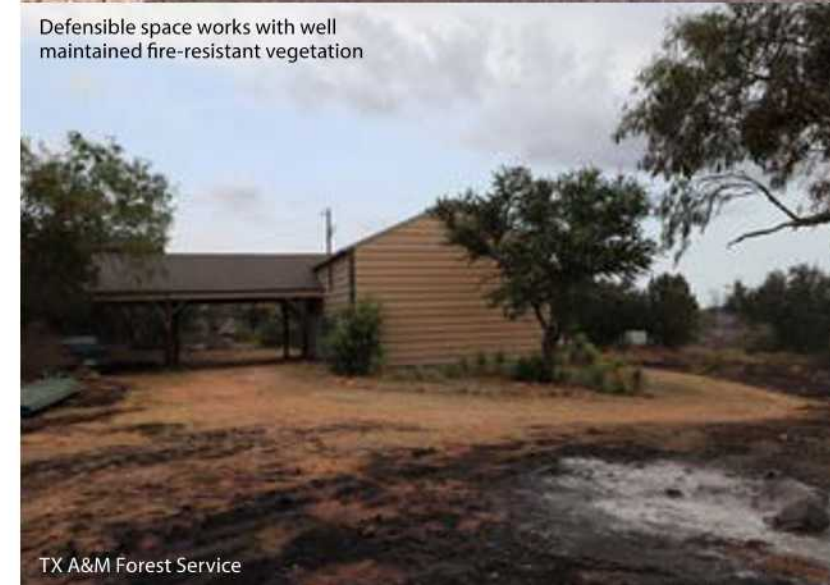
Defensible space works with well maintained fire-resistant vegetation